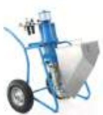
WIWA THICK-FILM / MORTAR PUMP Pressure ratio: 9-12:1 Max. output: 410-600 ccm