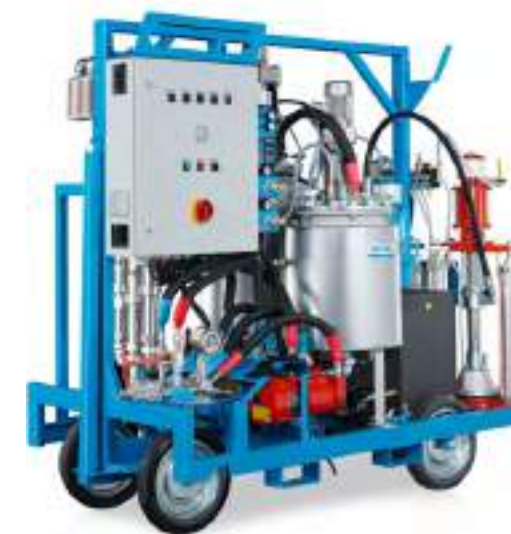
WIWA Duomix 333 PFP