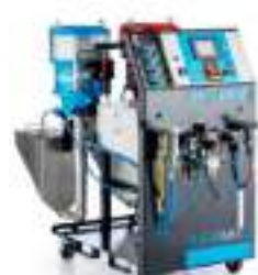
WIWA FLEXIMIX 2 HERKULES GX