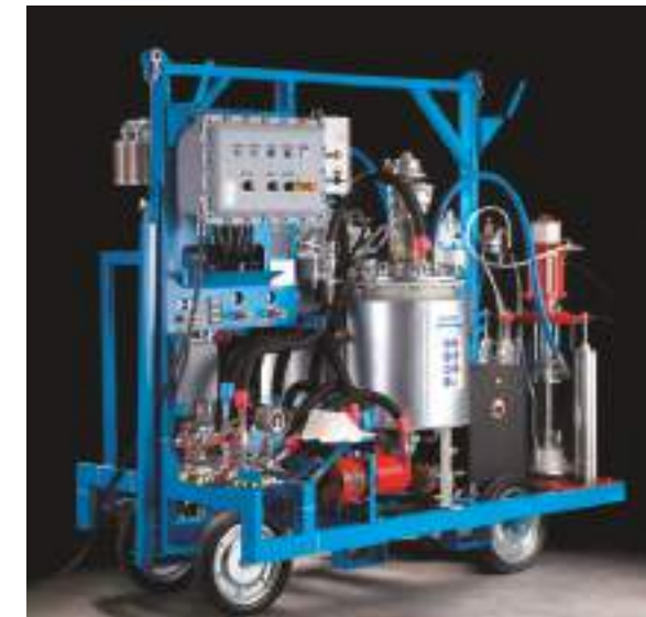
WIWA Duomix-333-PFP Atex