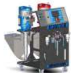
WIWA FLEXIMIX 2 PROFESSIONAL GX