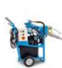
WIWA HYDRO PX E Pressure ratio: 1.3-3.4:1 Max. output: 72-275 ccm