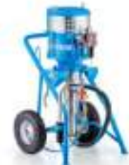
WIWA HERKULES GX Pressure ratio: 24-88:1 Max. output: 153-450 ccm