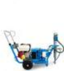
WIWA HYDRO PXG Pressure ratio: 1.3-2:1 Max. output: 72-111 ccm