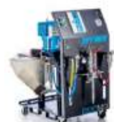
WIWA DUOMIX 270 GX Pressure ratio: 20-211:1 Max. output: 39-395 ccm