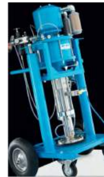
WIWA Herkules PFP

BUILDING NO. 7119 - STREET NO. 17 - MOKATTAM 11571 - CAIRO - EGYPT 0225041411 - 0225041410 info@leaders-egy.net +20100 199 78 00 - +2010 66666 477 www.leaders-egy.net